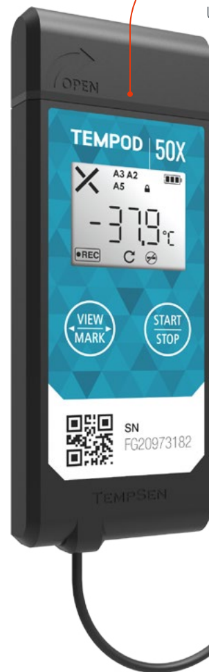
External NTC Probe Cable: 1m